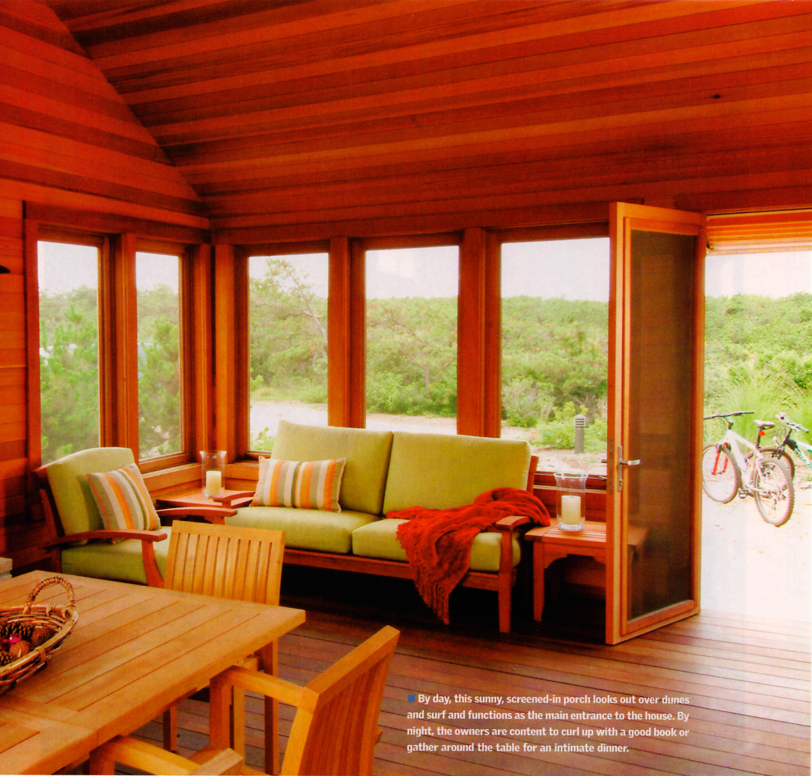
■ By day, this sunny, screened-in porch looks out over dunes and surf and functions as the main entrance to the house. By night, the owners are content to curl up with a good book or gather around the table for an intimate dinner.

“We wanted to create a house that was much more responsive to the site,” continues Miller, “one that would orient itself much better to the views. We paid a lot of attention to where the sun is at various points in the day, and to the winds. When you’re creating a house on such an exposed site, you want to provide sheltered areas.”