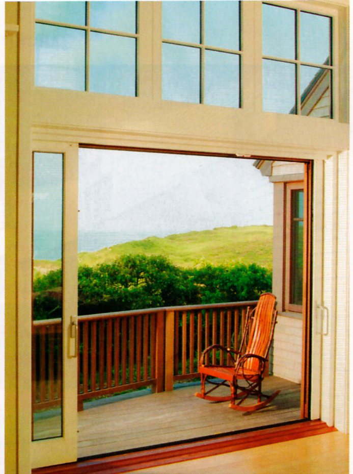
■ (above) While in the living room, the owners are able to open these sliding doors to take in the expansive view and ocean breeze. (left) This Red Sox/Yankees chess set was purchased at The Artful Hand in Boston.